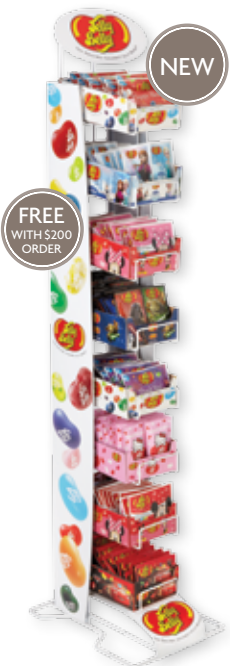
Jelly Belly® Caddy Rack Item # 88177