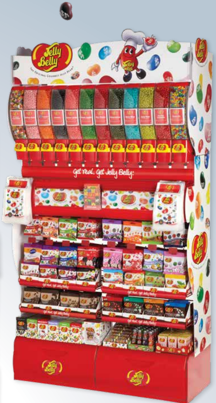
Jelly Belly® Free Standing Combo Display