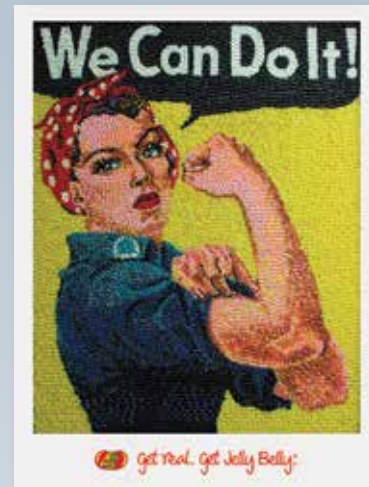
18" x 24" Jelly Belly Bean Art Poster We Can Do It Item # ZMD479 • 1 each