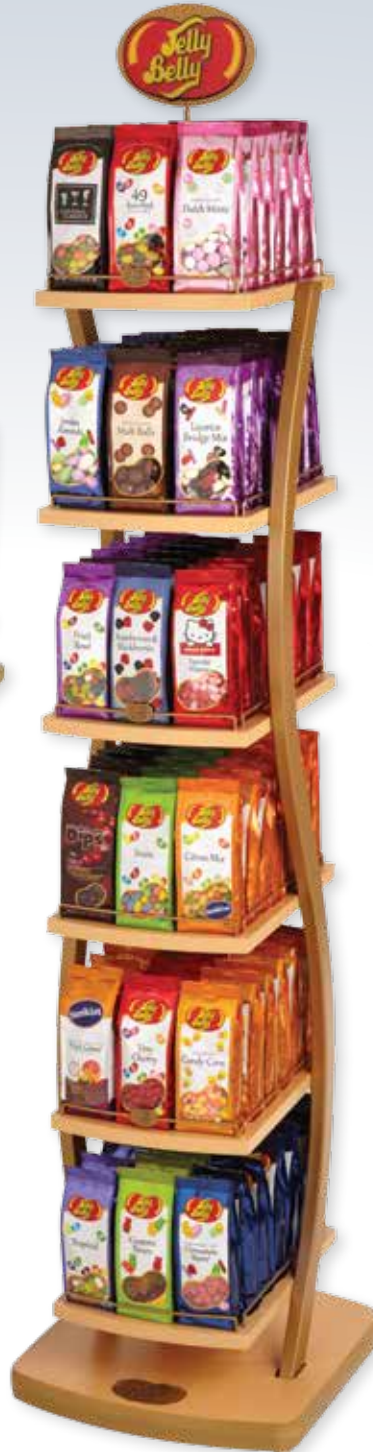
Jelly Belly® Silhouette Floor Display Item # 88117 • 1 unit • Dimensions: 15.12" w x 16" d x 66.25" h (62" without header) • 2 side shoppable • Holds 108 gift bags • Candy not included