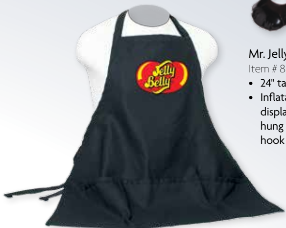
Jelly Belly® Apron Item # 88990 • 1 each • One size fits all • Features adjustable neck strap and large pockets