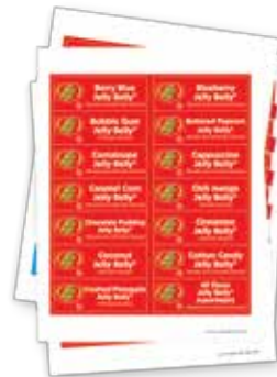
3 1/2" Jelly Belly Adhesive Labels