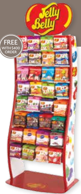
Jelly Belly Wave Rack Item # 88465