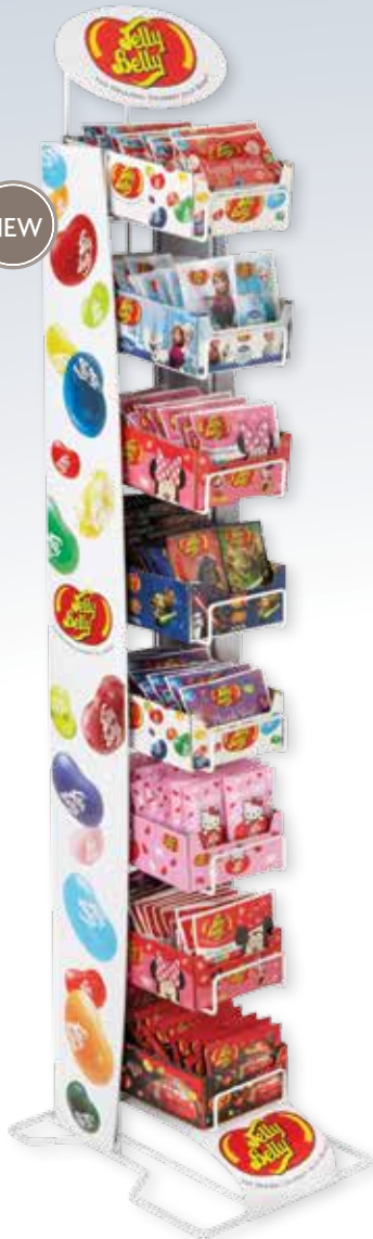
Jelly Belly® Silhouette Counter Top Display Item # 88116 • 1 unit • Dimensions: 11.88" w x 12.0" d x 25" h (21.5" h without header) • Holds 24 gift bags • Candy not included