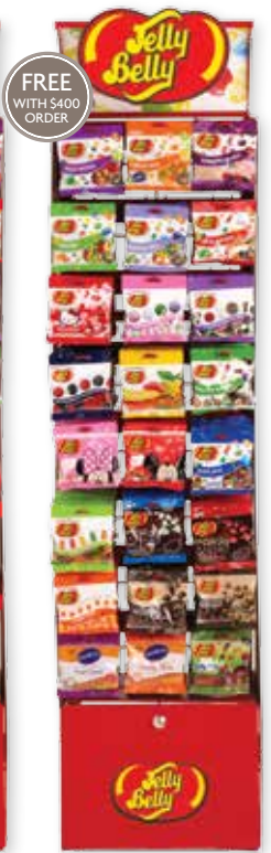
Curve Rack All Peg Item # 88168