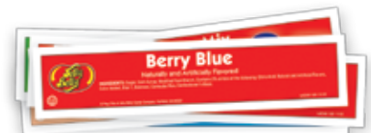
6 1/2" Confections Scoop Bin Ingredient Labels