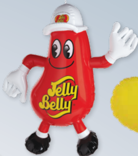
Mr. Jelly Belly® Inflatable Item # 88149 • 1 each • 24" tall • Inflatable character for displays or gifts. May be hung from ceiling; hook and string included