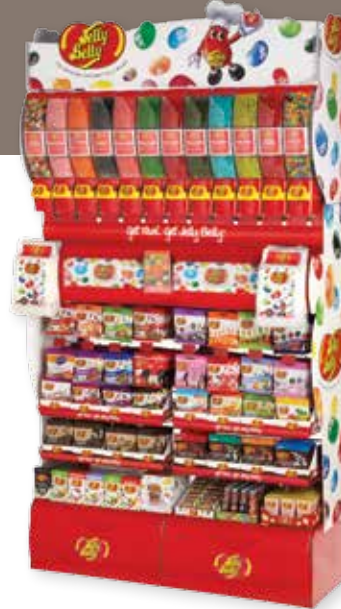
Free Standing Combo Display Item # 88145