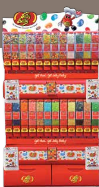
Free Standing Bulk Display Item # 88146