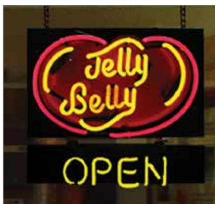
Jelly Belly® Logo Neon Light Sign Item # 88794 • 1 each • Dimensions: 18¼"w x 5"d x 11½"h • Sign can sit on a counter or hang from the wall or ceiling