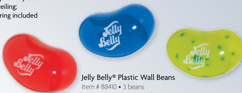
Jelly Belly® Plastic Wall Beans Item # 88410 • 3 beans • Dimensions: 15"w x 9"h • 3 per case • Mount half beans to store wall