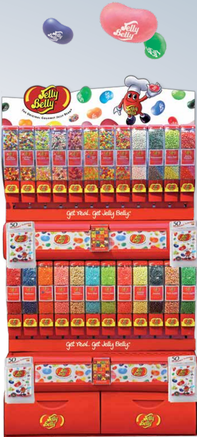
Jelly Belly® Free Standing Bulk Display