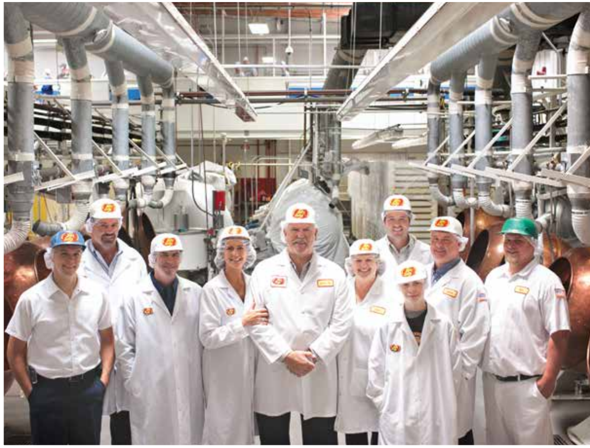
The fourth, fifth, sixth and seventh generations of our candy family work in the company.

From revolutionary candy making techniques to heart-warming packaging and gifts, innovation is at the heart of everything we do. We invite you to join us on the path of innovation, starting with this 2015–2016 catalog featuring some of the most popular items in the history of the company. How can we help you transform your business today? Give us a call and let's explore together.