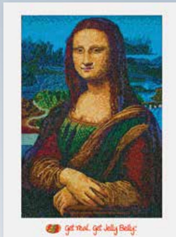
18" x 24" Jelly Belly Bean Art Poster Mona Lisa Item # ZMD478 • 1 each