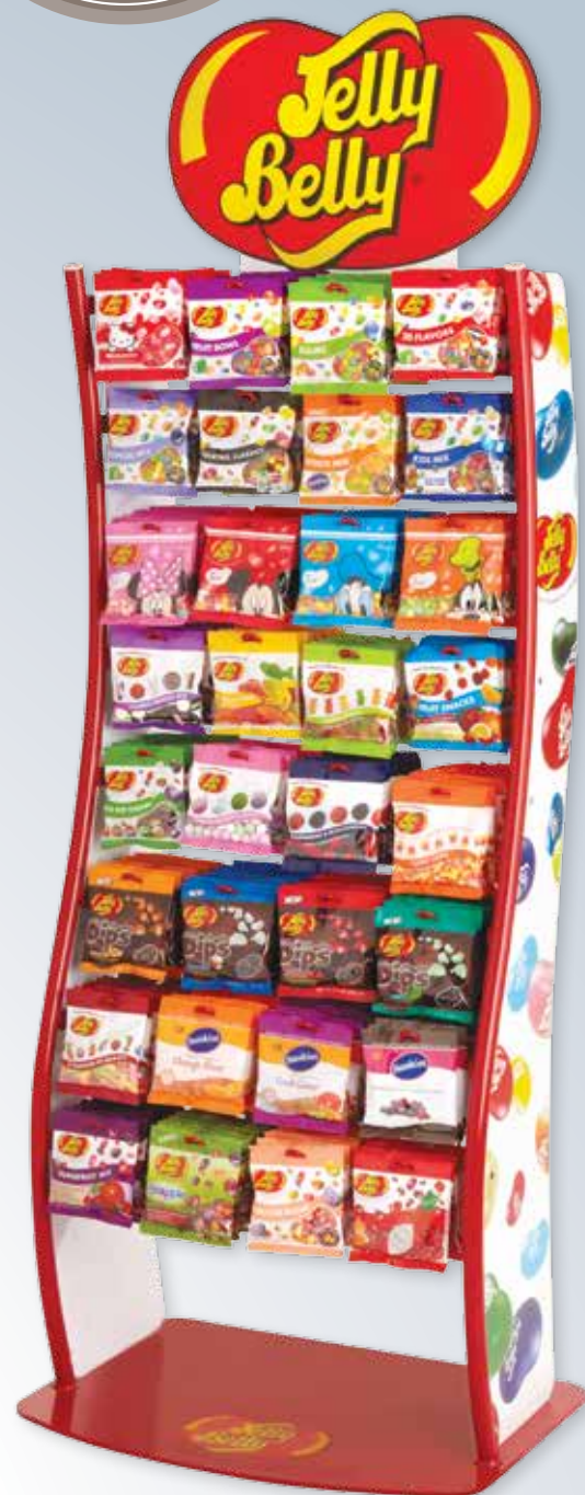
Jelly Belly® Wave Rack Item # 88465 • 1 unit