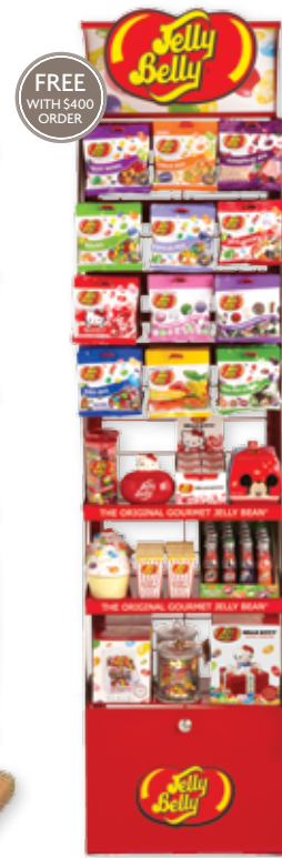
Curve Rack Combo Item # 88168 with # IAC1073