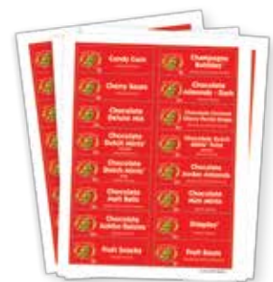
3 1/2" Confections Adhesive Labels