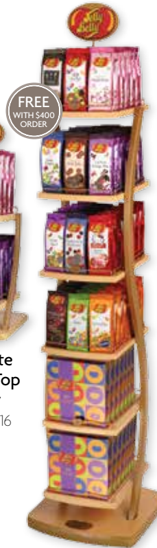
Silhouette Floor Display Item # 88117