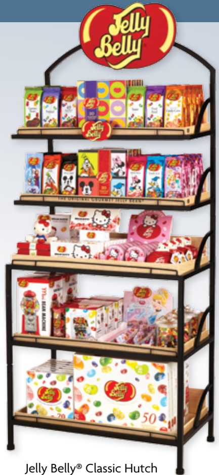
Jelly Belly® Classic Hutch Item # 88426 • 1 unit • Dimensions: 28" w x 15¾" d x 64½" h • Flexible design accommodates a wide range of Jelly Belly products • Candy not included