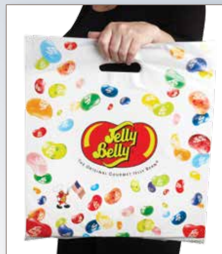
15" w x 16.5" h Jelly Belly Retail Shopping Bag Item # 88154 • 250 per case