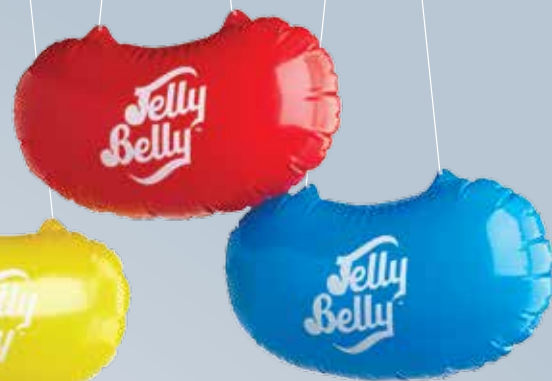
Jelly Belly® Inflatable Hanging Beans Item # 88157 • 3 beans • Dimensions: 18"w x 10"h • 3 per pack, string included • Colors: red, yellow and blue vinyl