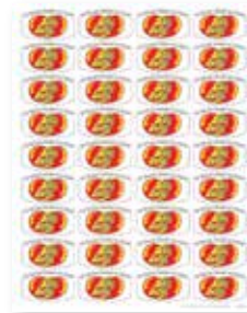
Item # ZMD120 36 per sheet