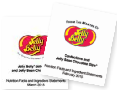
Nutrition Facts & Ingredient Statement Booklets