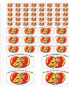
Item # ZMD118 56 per sheet • Various Sizes