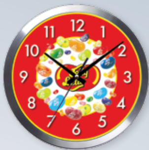
Jelly Belly® 14" Clock Item # 88020 • 1 each • Battery included