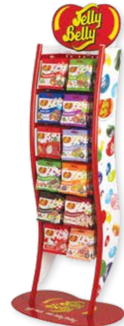
Jelly Belly® Ripple Rack Item # 88454 • 1 unit • Dimensions: 21 ¾" w x 12 ¾" d x 56 ¾" h • Holds 8 cases (96 - 3.5 oz. bags) • Small footprint • Candy not included