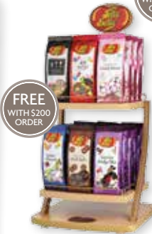
Silhouette Counter Top Display Item # 88116