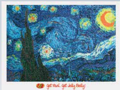
24" x 18" Jelly Belly Bean Art Poster Starry Night Item # ZMD477 • 1 each