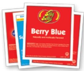
3 5/16" Jelly Belly Ingredient Labels - Gravity Bins