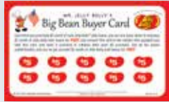
Mr. Jelly Belly's "Big Bean Buyer Card"