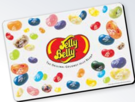
Jelly Belly® Counter Mat Item # 88263 • 1 each • Dimensions: 15"w x 10"h