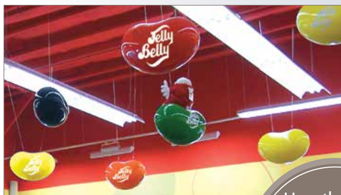
15" Jelly Belly® Plastic Hanging Beans Red (Very Cherry) - Item # 88122 Blue (Blueberry) - Item # 88124 Green (Green Apple) - Item # 88125 Orange (Sunkist® Orange) - Item # 88126 Pink (Cotton Candy) - Item # 88127 Black (Licorice) - Item # 88128 Yellow (Sunkist® Lemon) - Item # 88129

Hang the whole bean from the ceiling! Each carton includes a ceiling hook and plastic cord.