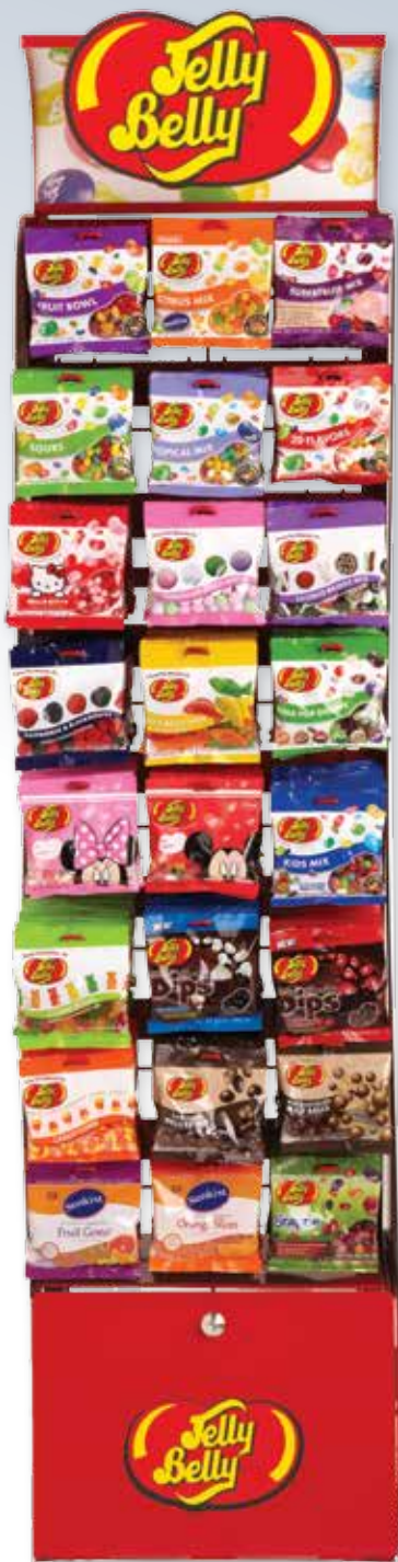
Jelly Belly® Curve Rack All Peg Item # 88168 • 1 unit

Compact displays can also be merchandised back-to-back for two-sided shopping.