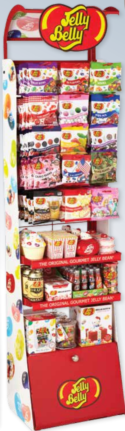
Create a Jelly Belly® COMBO Curve Rack with pegs and shelves! Order item #88168 display PLUS the Curve Rack Shelf Kit # 1AC1073.