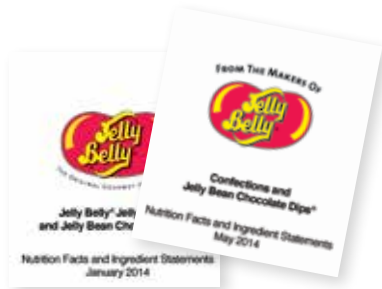
Nutrition Facts & Ingredient Statement Booklets Jelly Belly® Jelly beans • Item # 88050 Confections • Item # 88051 1 each

Jelly Belly® Stylized Logo Stickers • 3-color • Perfect for in-store custom packaged/gift items