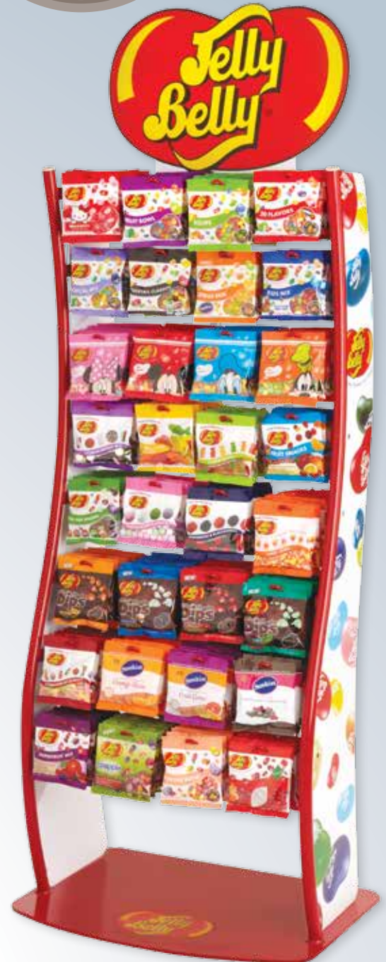
Jelly Belly® Wave Rack Item # 88465 • 1 unit