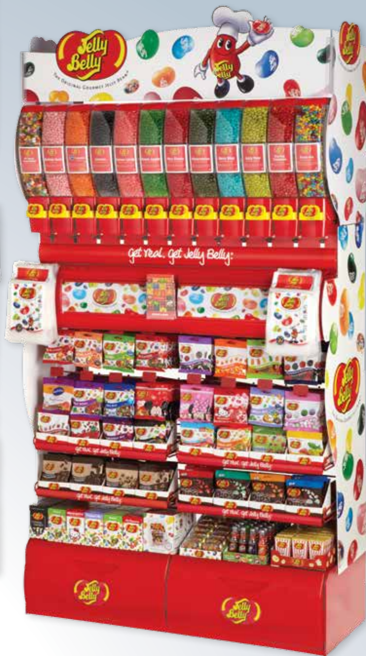
Jelly Belly® Free Standing Combo Display