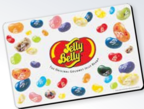
Jelly Belly® Counter Mat Item # 88263 • 1 each • Dimensions: 15" w x 10" h