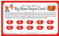
Mr. Jelly Belly's "Big Bean Buyer Card" Item #88039 • 50 per pack • Dimensions: 3 1/2" w x 2 1/8" h • Encourage customer loyalty