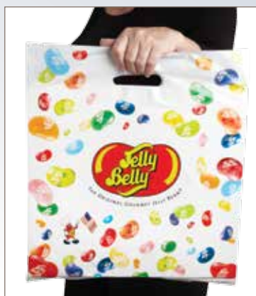
15" w x 16.5" h Jelly Belly Retail Shopping Bag Item # 88154 • 250 per case