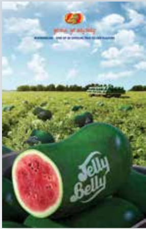
11" x 17" Watermelon Poster Item # ZMD483 • 1 each