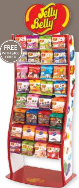
Jelly Belly Wave Rack Item # 88465