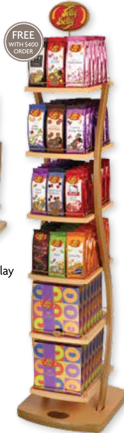
Silhouette Floor Display Item # 88117