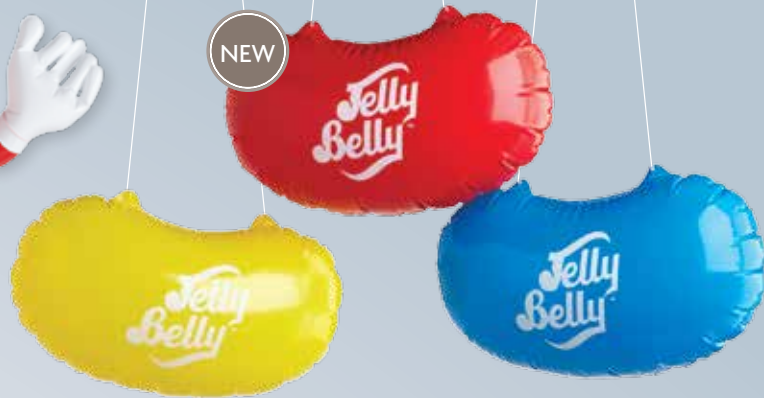
Jelly Belly® Inflatable Hanging Beans