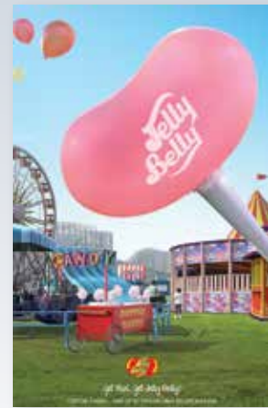
11" x 17" Cotton Candy Poster Item # ZMD484 • 1 each