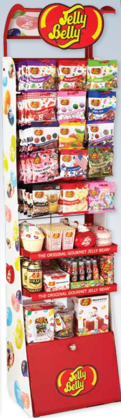
Create a Jelly Belly® COMBO Curve Rack with pegs and shelves! Order item #88168 display PLUS the Curve Rack Shelf Kit # 1AC1073.