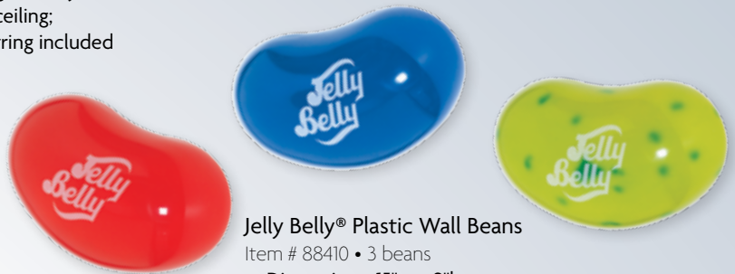
Jelly Belly® Plastic Wall Beans