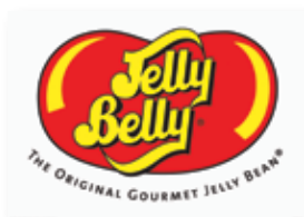
Jelly Belly Static Cling (large) Item # PS0610 • 1 each • Dimensions: 11" w x 8½" h • Perfect for door/window placement

Plastic Adapter Plate Item # PS0260 • 1 each • To be used for holding zip tear-off bags # 88046