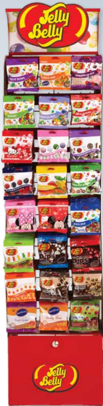
Jelly Belly® Curve Rack All Peg Item # 88168 • 1 unit

Compact display can also be merchandised back-to-back for two-sided shopping.