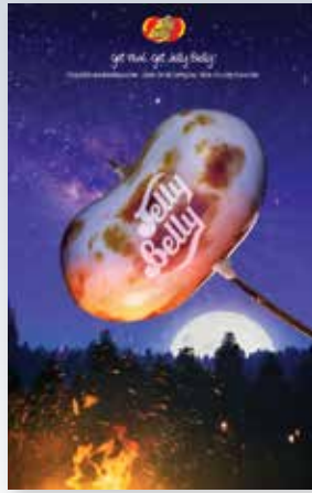
11" x 17" Toasted Marshmallow Poster Item # ZMD482 • 1 each