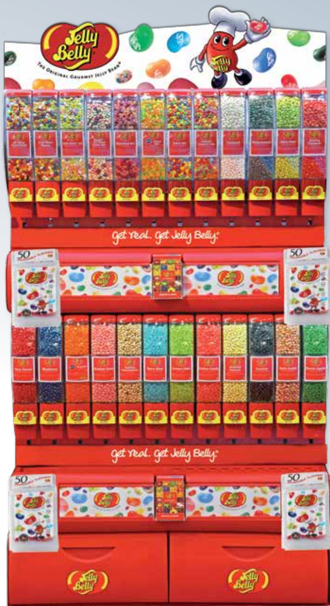
Jelly Belly® Free Standing Bulk Display