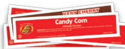
6 1/2" Confections Scoop Bin Ingredient Labels Item # LA2349 • 1 set