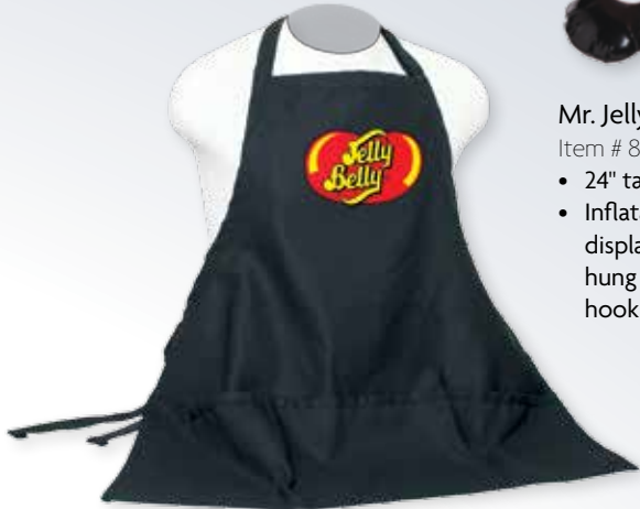
Jelly Belly® Apron Item # 88990 • 1 each • One size fits all • Features adjustable neck strap and large pockets