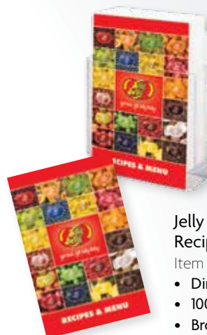
Jelly Belly® Menu & Recipe Brochure Item # 88007 • Dimensions: 3⅞" w x 6" h • 100 per pack • Brochure shows Jelly Belly® flavors and creative recipes