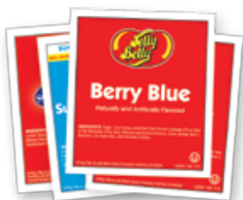
3 5/16" Jelly Belly Ingredient Labels - Gravity Bins Item # LA2394 • 1 set