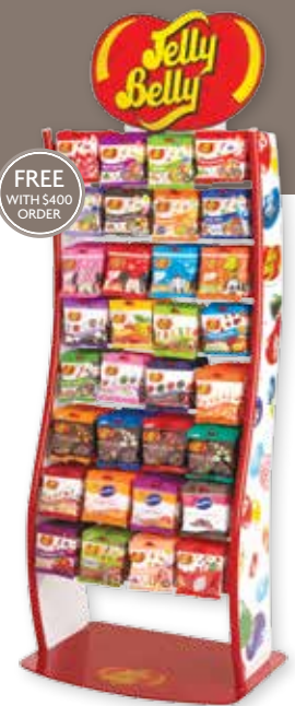
Jelly Belly Wave Rack Item # 88465