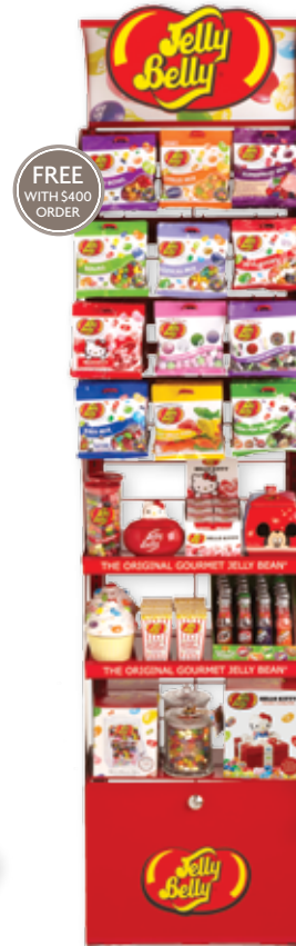
Curve Rack Combo Item # 88168 with # IAC1073