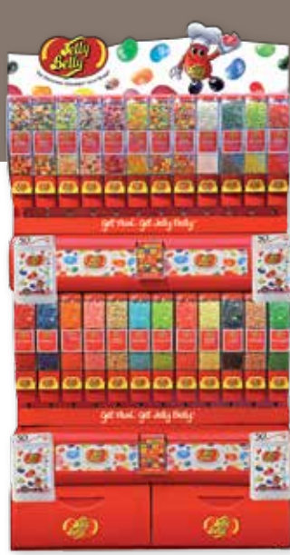
Free Standing Bulk Display Item # 88146