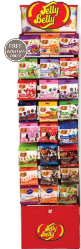
Curve Rack All Peg Item # 88168