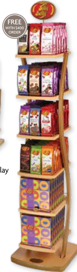
Silhouette Floor Display Item # 88117