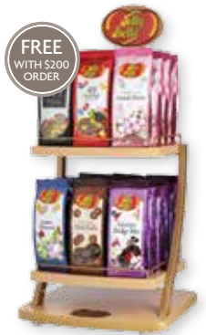
Silhouette Counter Top Display Item # 88116