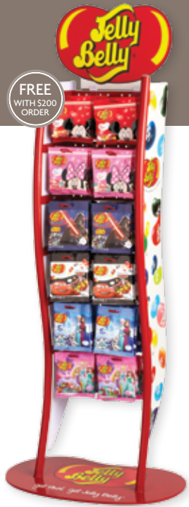
Ripple Rack Item # 88454