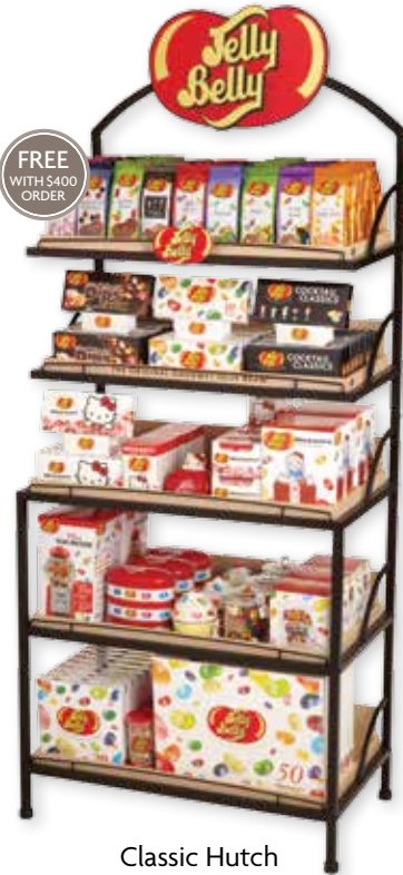
Classic Hutch Item # 88426