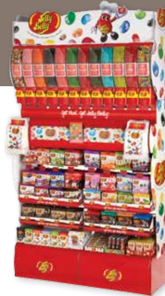
Free Standing Combo Display Item # 88145